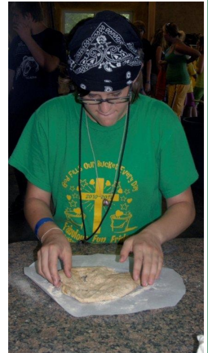
Campers make pizza from scratch, by starting with grinding the wheat.