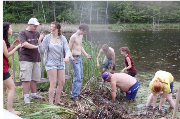
Lions and Leos working side by side at work bee.

without the great work of the volunteers at the Work Bee, they are great!" There are some great plans for next year. The Association of Past District Governors has agreed to volunteer at the Work Bee by acting as Task Leaders. They will welcome volunteers with the tasks, how to do it and the tools as soon as they arrive at camp. As the event has grown, it has become difficult to prepare and keep up with the many different task taking place at camp. With the help of the PDG's, we will accomplish more work and do it better!! Over the past year, the Districts have raised money for the Cabin Fan Project. It can get very hot