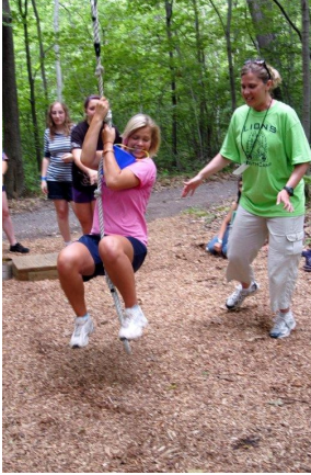
One of the Many Challenges Campers will find on our Teambuilding/Challenge Course at Bear Lake Camp.

"...outdoor play and exposure to nature has long-lasting effects on children and adults..."