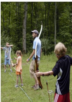
Campers Experience the Great Outdoors

At Lions Bear Lake Camp children are provided with opportunities to do outdoor activities such as archery, fishing, outdoor cooking, goal ball, beeper ball, and recently added, survivor skills. These activities are divided into camp experiences such as fishing and archery and activities that can be continued at home, such as goal ball and beeper ball for the visually impaired. These camping activities provide an opportunity for campers to do things that they may never have done before. During their overnight camping adventure, campers will pitch